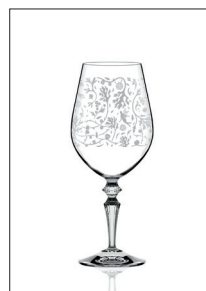
Galante + decoro