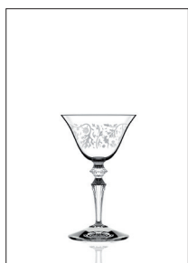
Astoria + decoro