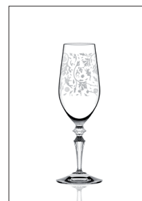
Fizz + decoro