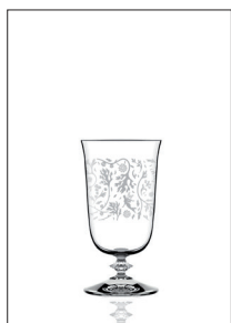
Alto-Ball + decoro