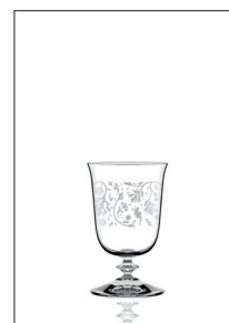
Rock-Gobbler + decoro