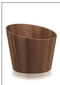
Timber Bowl Esotico Art.1618