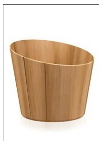
Timber Bowl Naturale Art.1618