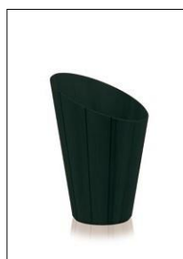
Timber Bucket Carbone Art.1592