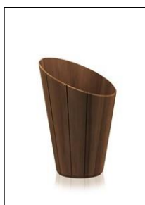
Timber Bucket Esotico Art.1592