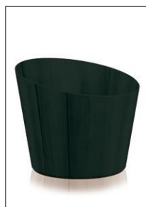
Timber Bowl Carbone Art.1618