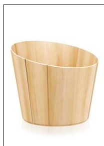
Timber Bowl Sbiancato Art.1618