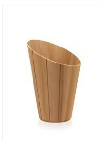
Timber Bucket Naturale Art.1592