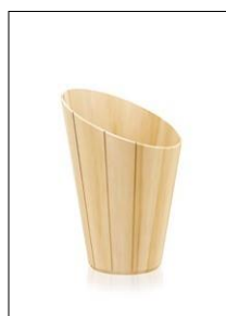
Timber Bucket Sbiancato Art.1592